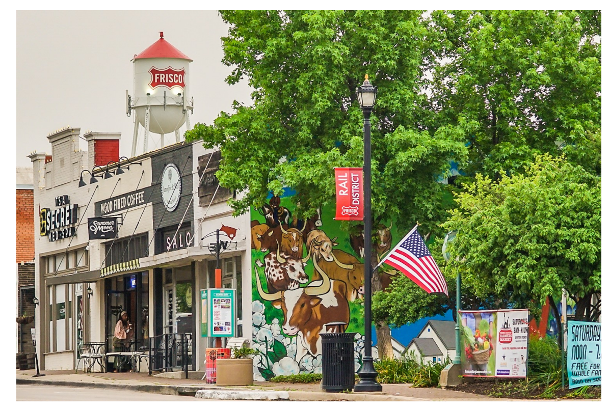
Rail District in Frisco