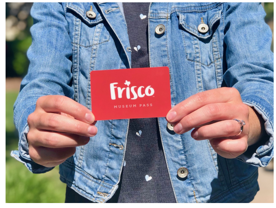
Frisco Museum Pass