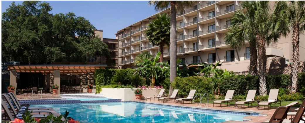
Marriott Plaza San Antonio

A link to the form for submission of nominees will be sent to the TAIR Listserv in mid-August.