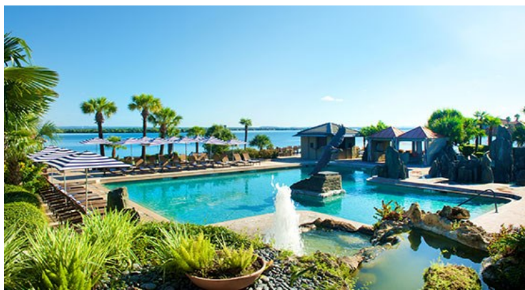
Horseshoe Bay Resort