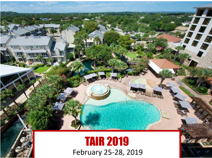
TAIR 2019 February 25-28, 2019 Horseshoe Bay Resort Horseshoe Bay, TX