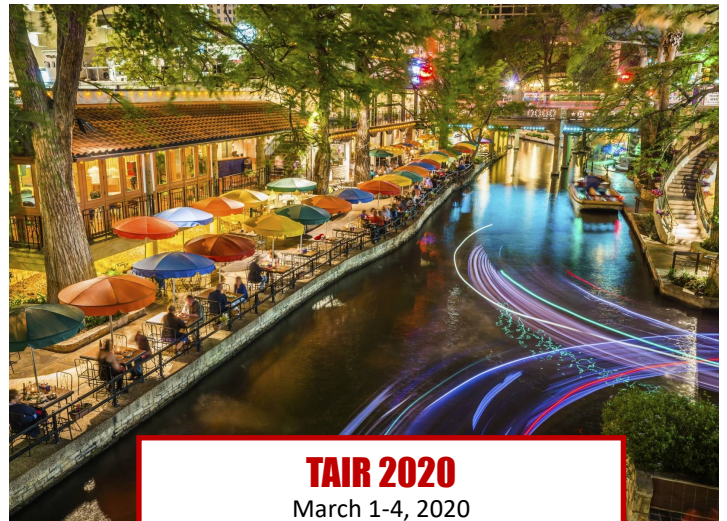
TAIR 2020 March 1-4, 2020 Marriott Plaza San Antonio San Antonio, TX