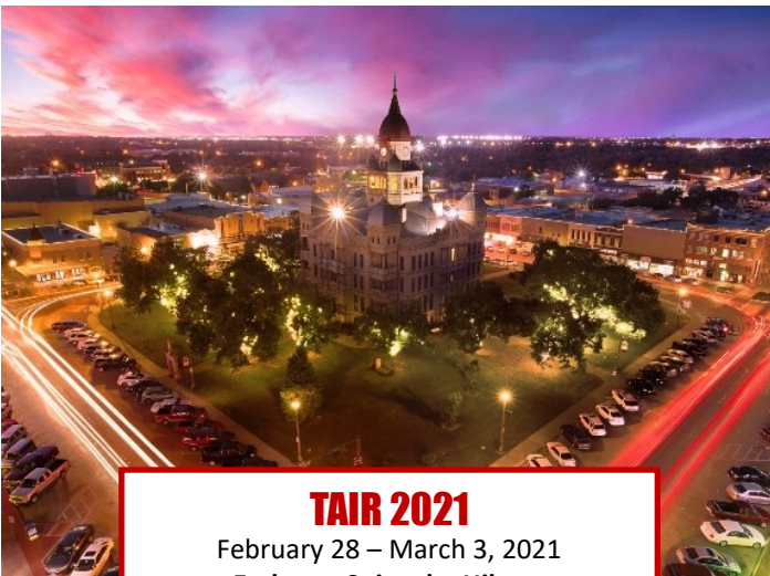
TAIR 2021 February 28 – March 3, 2021 Embassy Suites by Hilton, Denton Convention Center Denton, TX