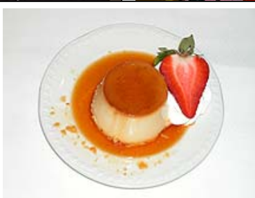
The Perfect Flan