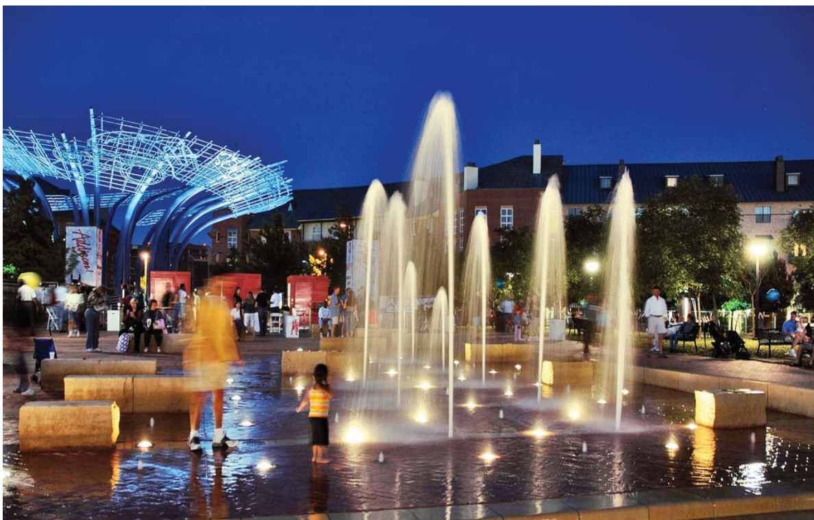
Blueprint Circle